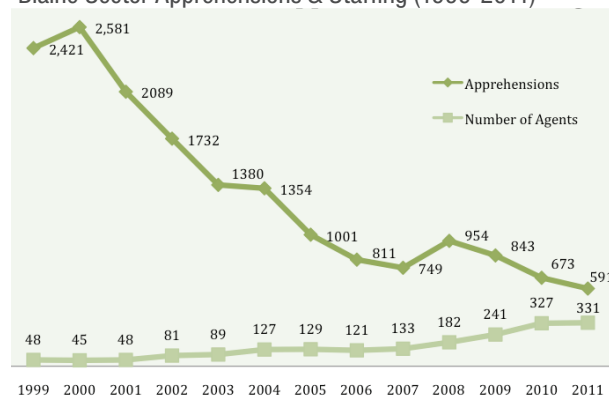
Blaine Sector Apprehensions & Staffing (1999-2011)

Source: CBP.gov U.S. Border Patrol Statistics